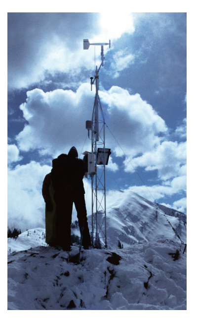
Data measured by this weather station near Aspen, Colorado is used in avalanche forecasting.