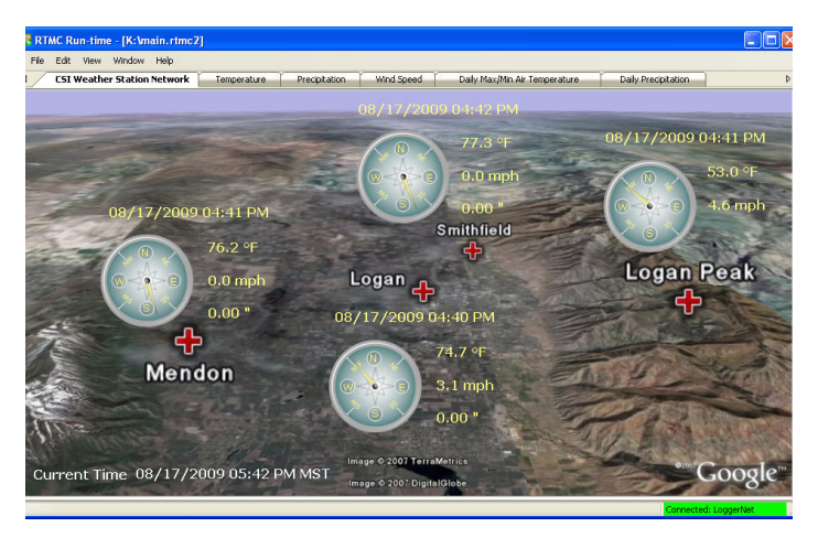
RTMC, a program for displaying the datalogger's data, is bundled with LoggerNet and RTDAQ. RTMCRT and RTMC Web Server clients also use forms created in the developer mode of RTMC.

Our datalogger support software packages provide more capabilities than our starter software. These software packages contains program editing, communications, and display tools that can support an entire datalogger network.