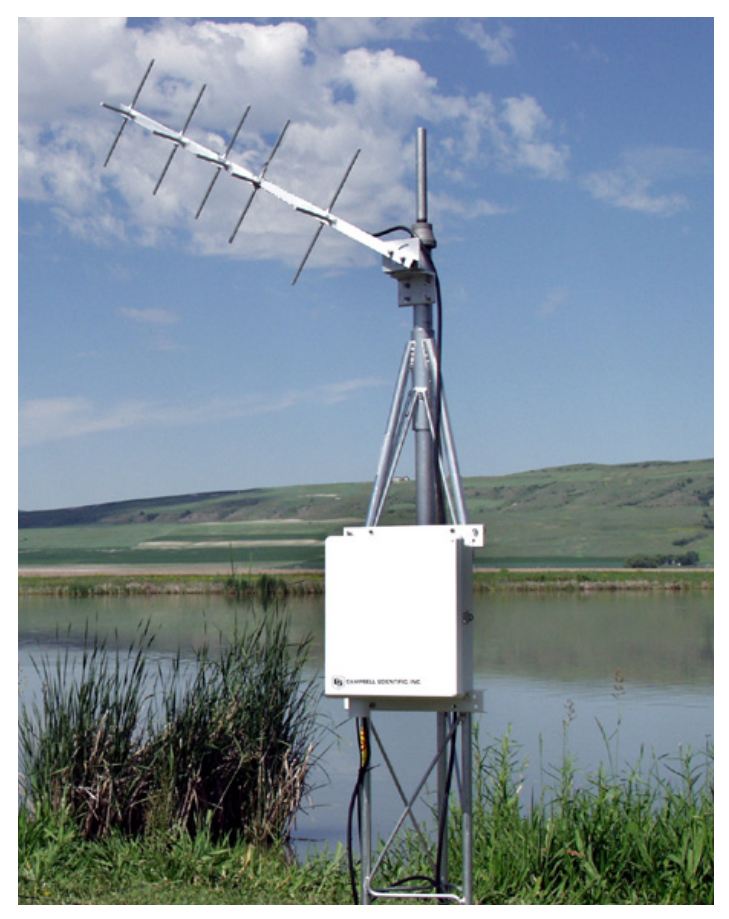
Our GOES transmitters are used for stream stage (shown), water quality, and rainfall applications.

Satellite transmitters offered by Campbell Scientific include a NESDIS-certified GOES transmitter, an Argos transmitter, an Iridium transmitter, and an Inmarsat BGAN satellite IP terminal. Satellite telemetry offers an alternative for remote locations where phone lines or RF systems are impractical.