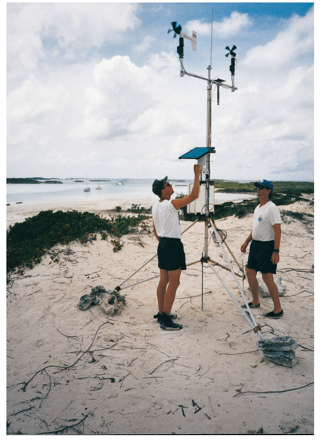
Meteorological conditions affecting marine larvae distribution are monitored at Exuma Cay, Bahamas.

The CR800 series is used in long-term climatological monitoring, meteorological research, and routine weather measurement applications.