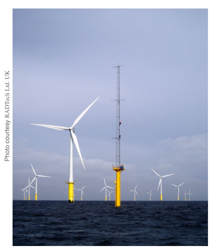
A Campbell Scientific datalogging system monitors this offshore wind farm located between Rhyl and Prestatyn in North Wales at about 7 to 8 km out to sea.

For turbine performance applications, the CR800 series monitors electrical current, voltage, wattage, stress, and torque.