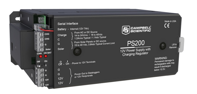
The PS200 (above) and CH200 can monitor charge input voltage, battery voltage, on-board temperature, battery current, and load current.

Also available are the BP7, BP12, and BP24 battery, which provide nominal ratings of 7, 12, and 24 Ah, respectively. The BP7 is typically used instead of the PS150 or PS200 when the battery needs to be mounted under the 31143 Hinged Stack Bracket. The BP12 and BP24 batteries are for powering systems that have higher current drain equipment such as satellite transmitters. The BP7, BP12, and BP24 should be connected to a regulated charging source (e.g., a CH200 or CH150 connected to a unregulated solar panel or power converter).