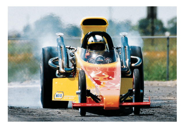
Vehicle monitoring includes not only passenger cars, but airplanes, locomotives, helicopters, tractors, buses, heavy trucks, drilling rigs, race cars, and motorcycles.

This versatile, rugged datalogger is ideally suited for testing cold and hot temperature, high altitude, off-highway, and cross-country performance. The CR800 and CR850 are compatible with our SDM-CAN interface, GPS16X-HVS receiver.