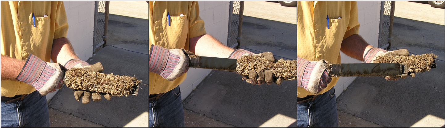
Two sleeve options are offered by Campbell Scientific. The three above photographs show the plastic sleeve being removed.